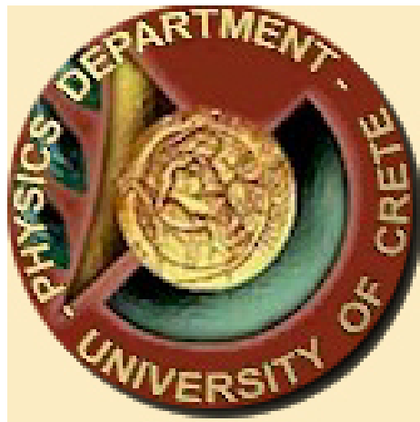
University of Crete